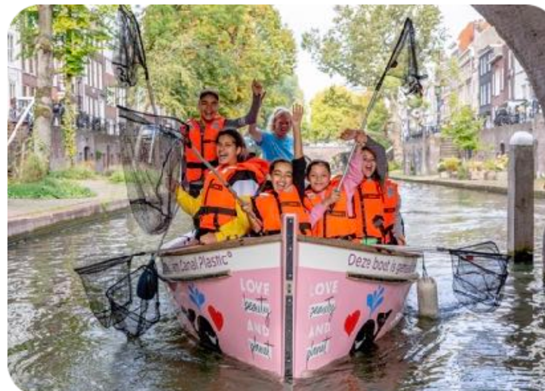
DONATE TO THE FOUNDATION