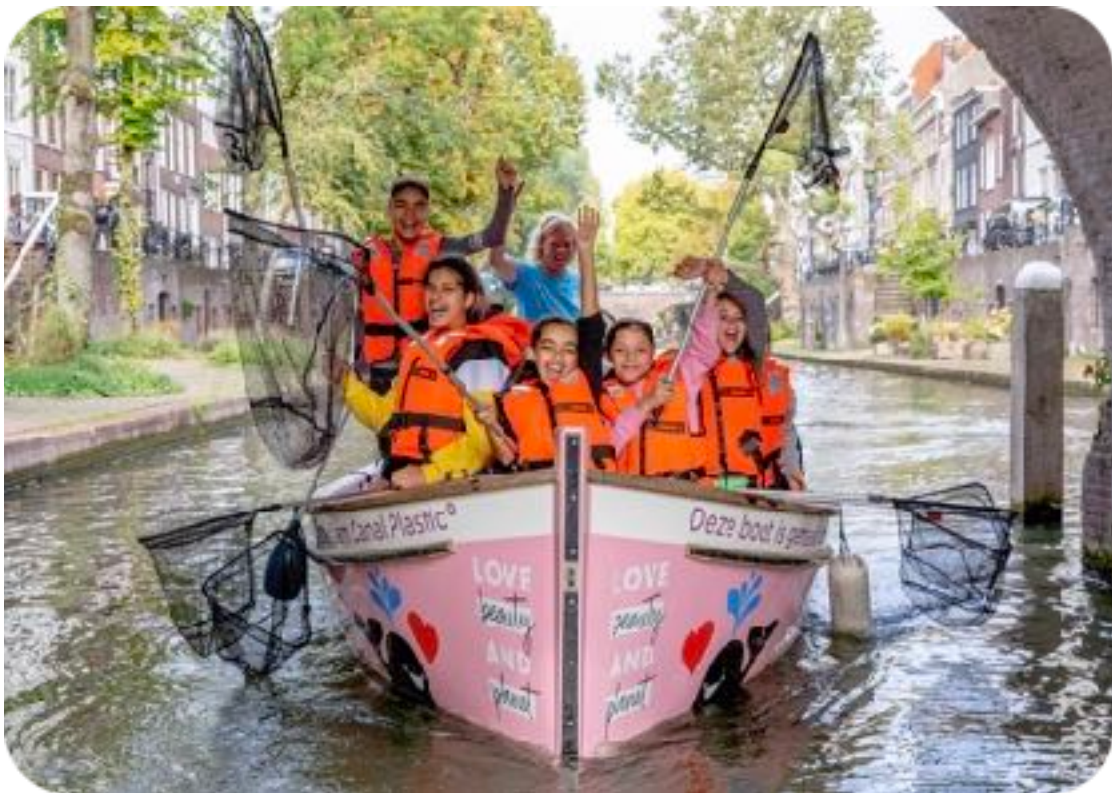
DONATE TO THE FOUNDATION