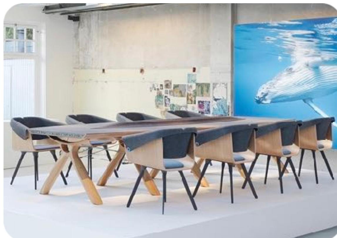
CIRCULAR PLASTIC WHALE FURNITURE BY VEPA