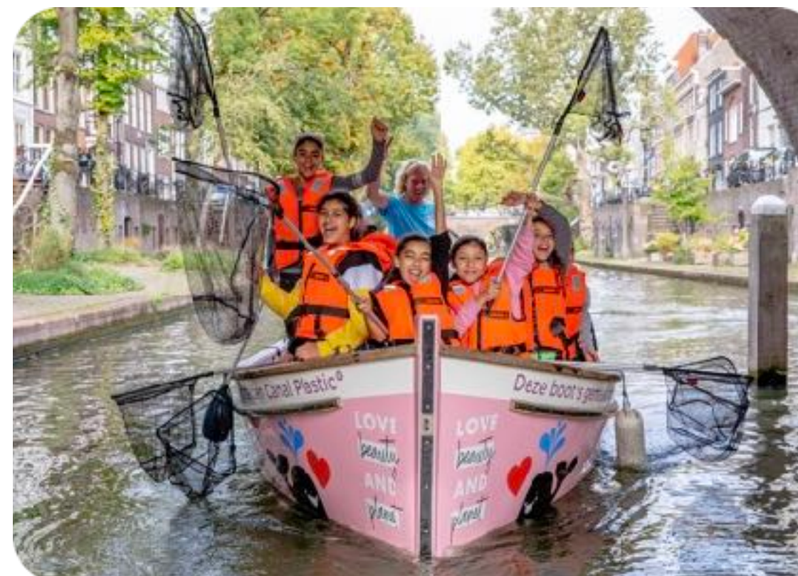
DONATE TO THE FOUNDATION