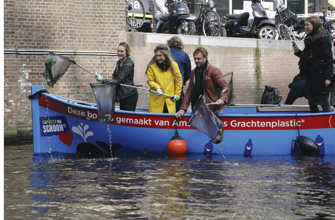
Above: Amsterdam plastic soup. Below: Goup effort.